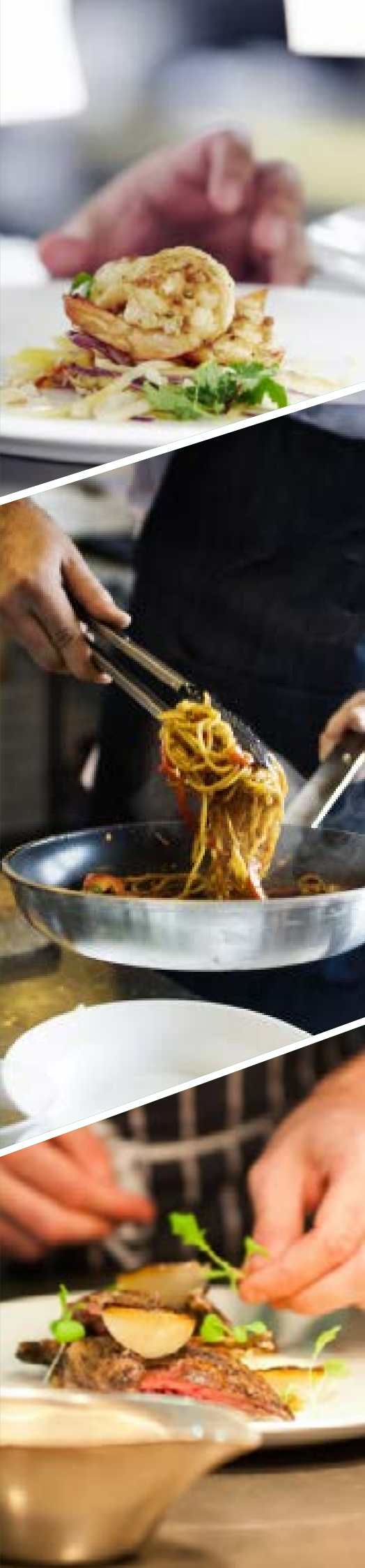
Certificate III in Commercial Cookery